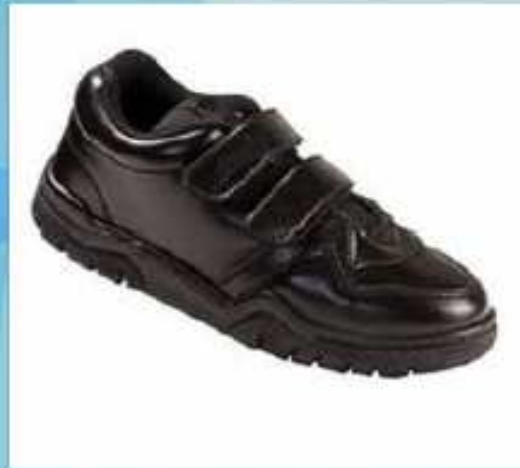
Shoes- With PU sole and Velcro attachment