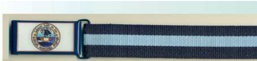
Belt- Synthetics woven webbing with powder coated buckle logo of KV on buckle